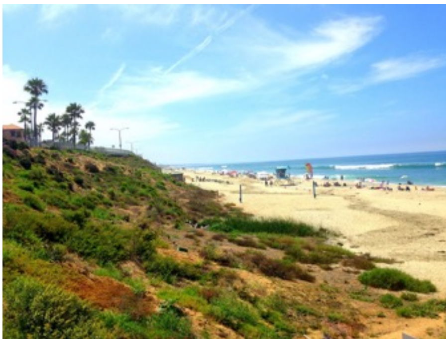
CARLSBAD BEACHES

You can find a full list of detailed info for all San Diego Beaches here: www.sandiego.org/what-to-do/beaches.aspx