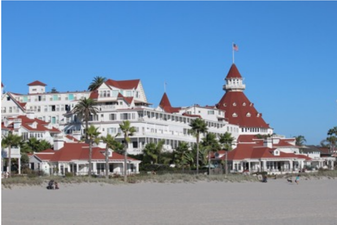
HOTEL DEL CORONADO