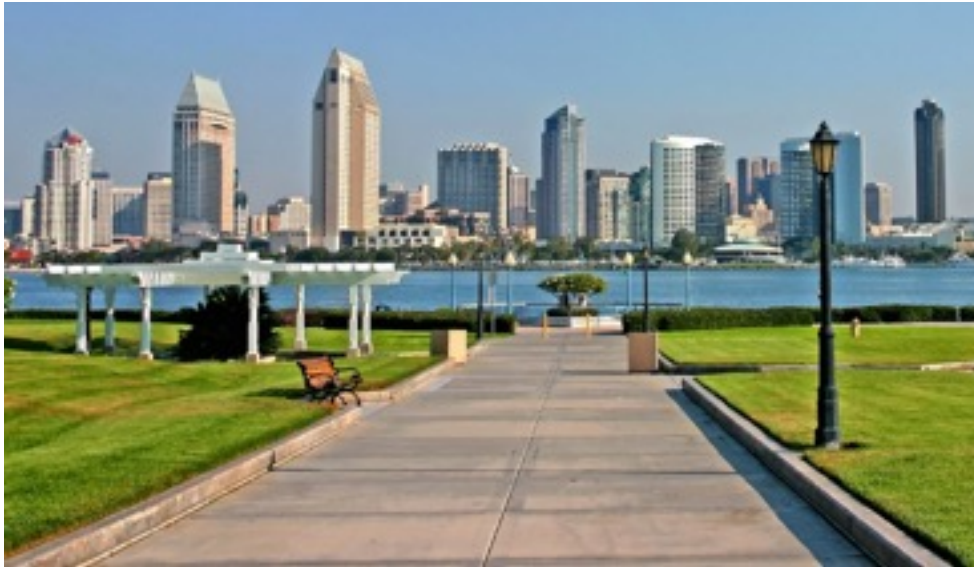
DOWNTOWN VIEW - FREEIMAGES.COM

*Cover photos courtesy of Freeimages.com and Pixabay.com. All images subject to "Fair-use" policies, where credit not indicated.