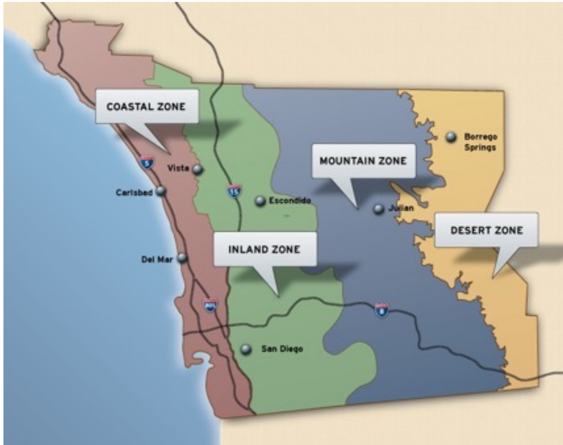
THE 4 CLIMATE ZONES OF SAN DIEGO COUNTY – COASTAL, INLAND, MOUNTAIN & DESERT

The area is known for wide ranging temperatures within short distances. Most of the coastal climates rarely fluctuate by 15°F between highs and lows, but as you move only a few miles east, inland areas can increase these ranges by 30°F or more.