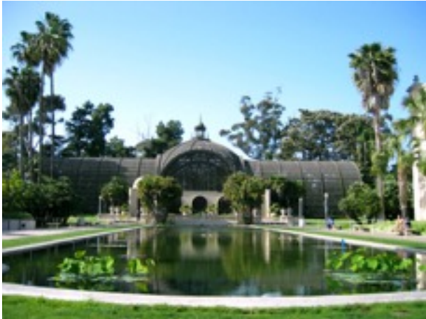
BALBOA PARK BOTANICAL GARDENS

The diverse landscape of San Diego provides amazing biodiversity across ocean habitats, marshes, deserts, mountains and canyons. And the parks of San Diego truly display the fully beauty of the region.