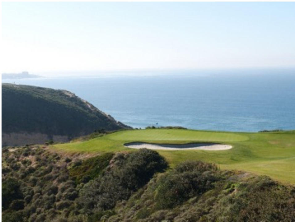
TORREY PINES - NORTH COURSE

**And according to Golf Digest, 17 of America's top 50 greatest teachers are San Diego area instructors.