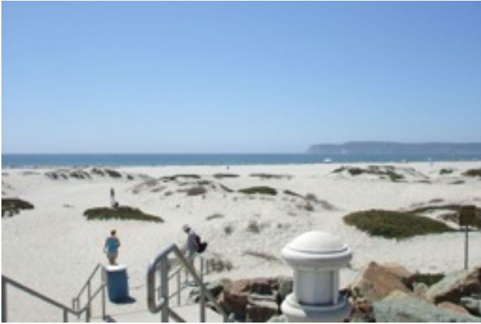
CORONADO'S WHITE SAND BEACHES

Some of the best beach communities in San Diego include Pacific Beach, Mission Beach, La Jolla, Del Mar, Solana Beach, Encinitas, Cardiff, Carlsbad and Oceanside ... each offering a different aspect of the San Diego beach lifestyle.