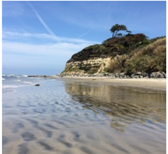
SAN DIEGO BEACHES

Many beaches are filled with options like volleyball, camping, BBQ - fire pits. You'll also find long beautiful piers for fishing or just enjoying the great views.